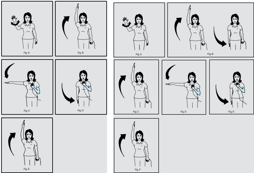
Figure 1. FORWARD START.